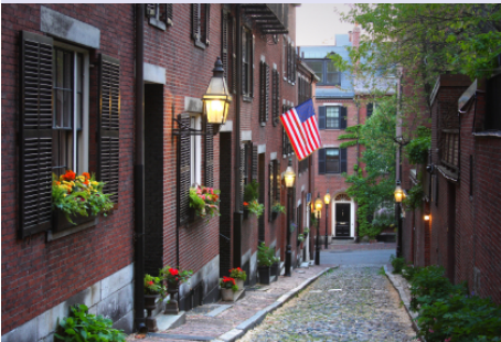
Beacon Hill, Boston MA

Tobolsky and Wachslers CPAs, LLC PO Box 1007 Burlington, MA 01803